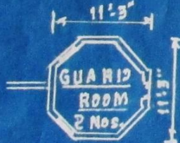
GUARD ROOM 2 Nos. SCALE :- 1" = 10' FTS

BUILTUP AREA OF GUARD ROOM, CANTEN, STORE, WAITING ROOM, GENERATOR ROOM, PARKING, AUDITORIUM ETC. = 8191.25 SQ FT OR 761.058 METERS