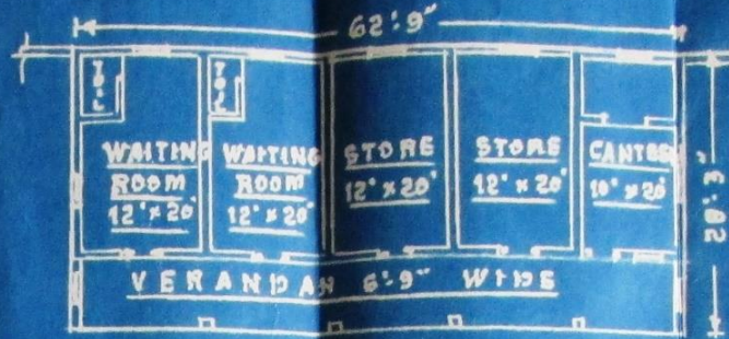
GROUND FLOOR PLAN SCALE :- 1" = 16' FTS